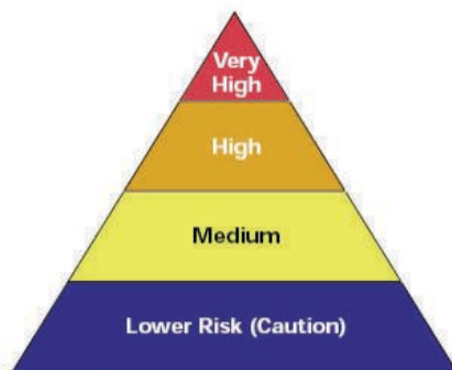
Occupational Risk Pyramid for COVID-19

Worker risk of occupational exposure to SARS-CoV-2, the virus that causes COVID-19, during an outbreak may vary from very high to high, medium, or lower (caution) risk. The level of risk depends in part on the industry type, need for contact within 6 feet of people known to be, or suspected of being, infected with SARS-CoV-2, or requirement for repeated or extended contact with persons known to be, or suspected of being, infected with SARS-CoV-2. To help employers determine appropriate precautions, OSHA has divided job tasks into four risk exposure levels: very high, high, medium, and lower risk. The Occupational Risk Pyramid shows the four exposure risk levels in the shape of a pyramid to represent probable distribution of risk. Most American workers will likely fall in the lower exposure risk (caution) or medium exposure risk levels.